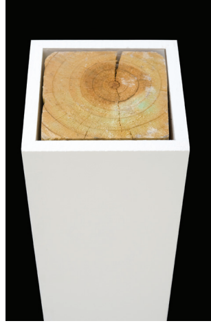
KLEERWrap POST WRAP Available in a variety of sizes. See chart above.

*Refer to the Kleer Lumber Limited Lifetime Warranty for details.