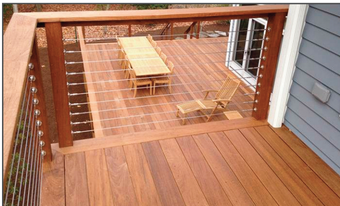
Iron Woods® Ipe Vanish Decking™

Choose the right product for your project. Budget, Climate, Aesthetics and Site Conditions all impact product, profile, and species selections.